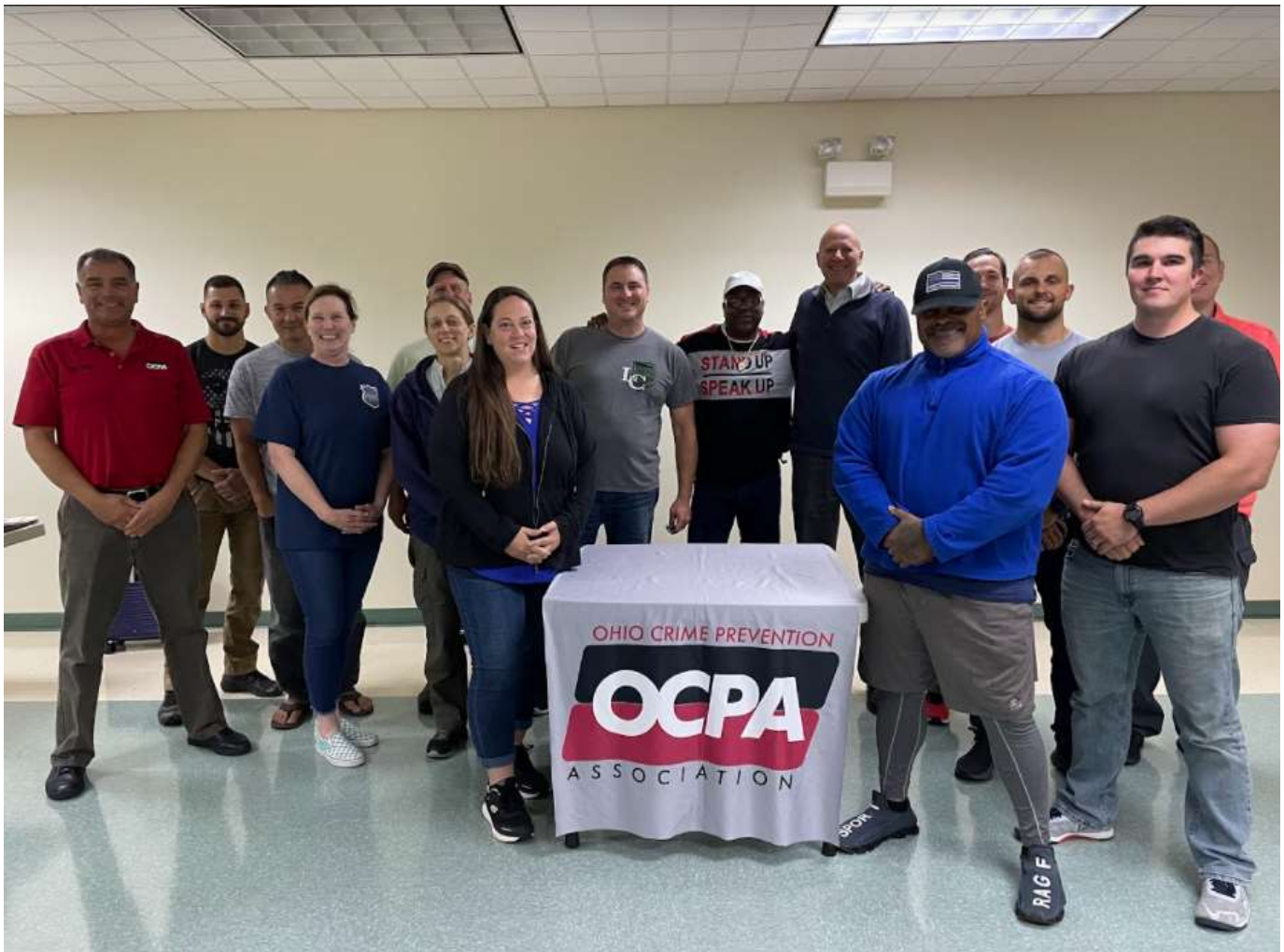
OCPA congratulates our newest Crime Prevention Specialists class of 2021

Host: Willoughby Hills Police Department