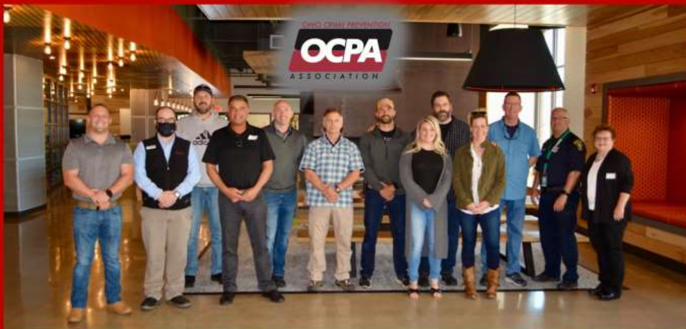
Advanced CPTED Class 01-2021 • Hosts: Westlake Police & Crocker Park • May 26-27, 2021