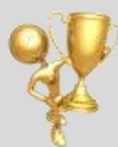
Miami Valley Crime Prevention Association