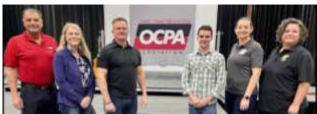
CPS attendees -February 2022- Lima, Ohio

In 2022, the OCPA welcomed 54 new members with the designation of Crime Prevention Specialist.